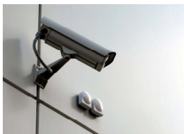
Solution for IP based Surveillance Cameras

The unit is equipped with two Dual Gigabit LAN ports which can be used as a great data storage solution for DVR & NVR system and IP surveillance video cameras. S L7280 IPSAN provides has great data security features for remote data backup & authentication management.