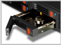
Hot Swappable Tray